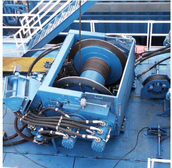
◀ Vane crossing vane motors power top drives for oil and gas exploration.