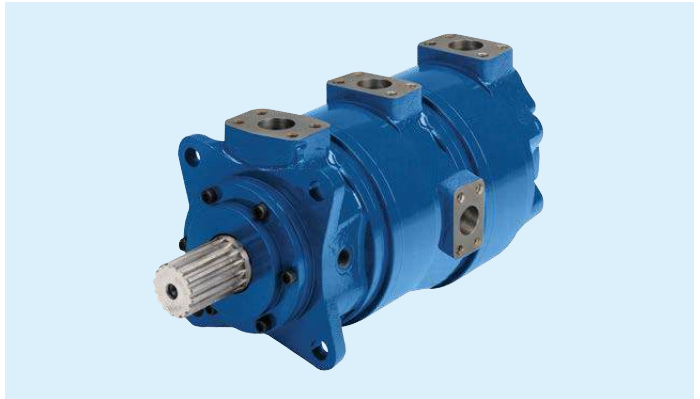
▲ MV037/057 4-Port – 500 rpm, 6032 lb-ft(8178 Nm) Combines any two displacements from the 37 and/or 57 series displacement choices in a 4-port configuration. Allows for 2- or 3-speed operation using external valving. Available in both A and D designs. Many of the same optional choices listed above are available.