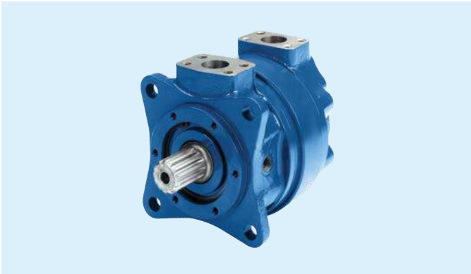
▲ MV037 – 1000 rpm, 2007 lb-ft (2721 Nm) Offered in A [3000 psi (207 bar)] or D version [4500 psi (310 bar)]. Splined, tapered, straight keyed, and double output shafts are standard, along with through holes to 1 1/2". Optional thrust and radial load bearings with substantial capacity, tach pickups, double stacks (up to twice the torque), and brake mounts available. SAE D mount.