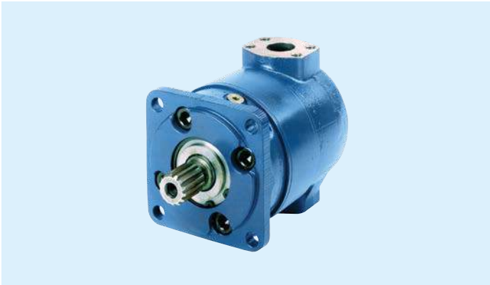
▲ MV015 – 2000 rpm, 509 lb-ft (690 Nm) Offered in single, two-speed, double output shafts, wheel-bearing style, and retractable shafts along with splined, tapered, or straight keyed shafts. Through-hole and thrust bearing options also available. SAE C mount.