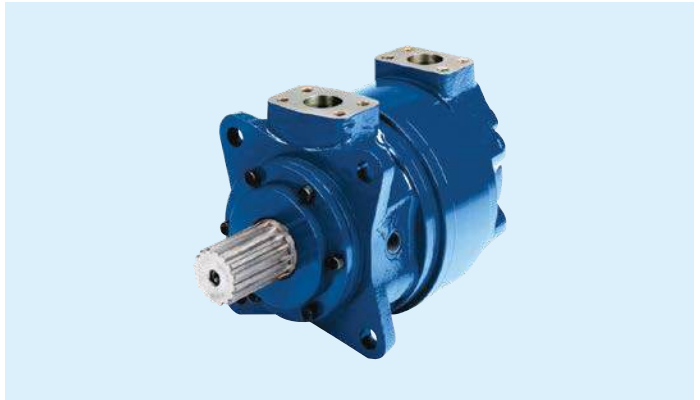
▲ MV057 – 500 rpm, 3016 lb-ft (4089 Nm) Offered in A [3000 psi (207 bar)] or D version [4500 psi (310 bar)]. The same features offered in the 37 Series are available in a motor that's one inch longer. Modified SAE D mount.